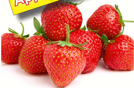
Organic Strawberries 1 Lb Pkg