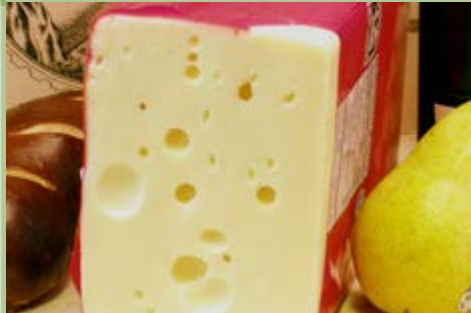
Local Baby Swiss