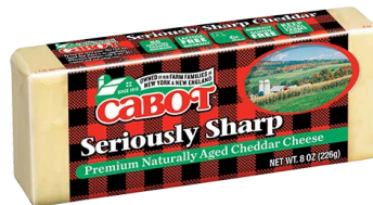
Cabot Cheese All Varieties