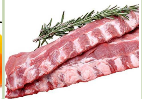
Extra Meaty All Natural Pork Back Ribs