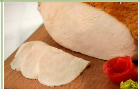
Boars Head Oven Roast Turkey