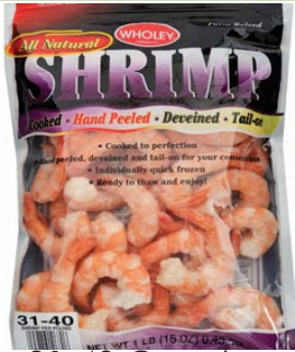
Wholey 31-40 Count Cooked Shrimp 1 LB Bag