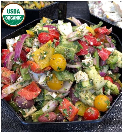
Organic Greek Salad