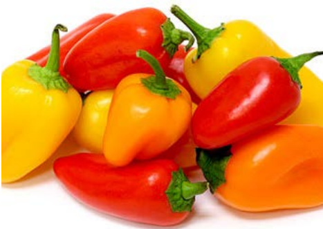
Organic Mini Peppers 1 LB Pkg