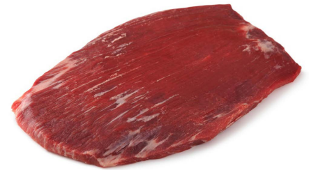
Pasture Fed Beef Flank Steak