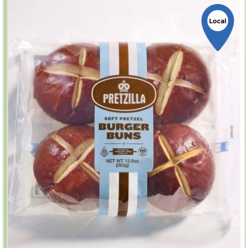
Pretzilla Hamburger and Sausage Buns