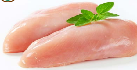
Organic Boneless Skinless Chicken Breast