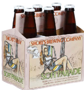
Shorts Brewery All 6 pack Varieties