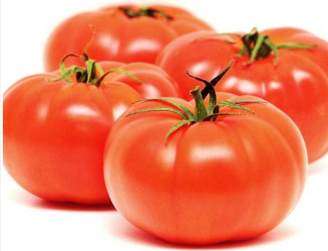
Organic Beefsteak Tomatoes