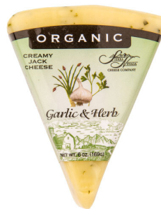
Sierra Nevada Cheese Varieties