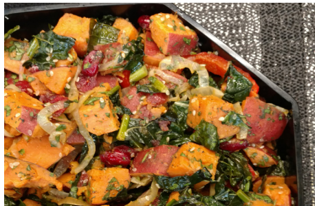
Organic Sesame Sweet Potato Salad