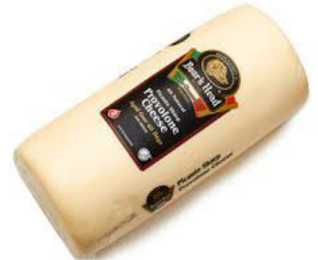
Boar's Head Picante Provolone