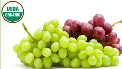
Organic Red and Green Grapes