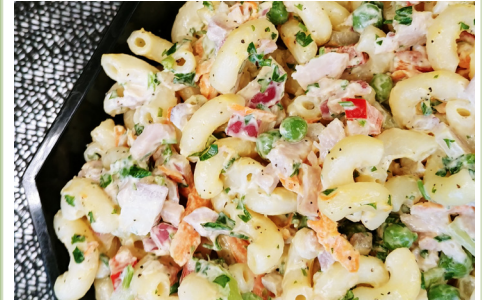
Classic Macaroni Salad