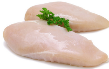
Organic Boneless Skinless Chicken Breast