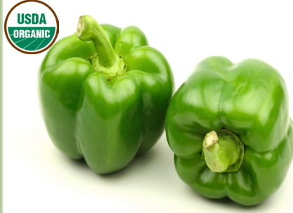
Organic Wisconsin Grown Green Peppers