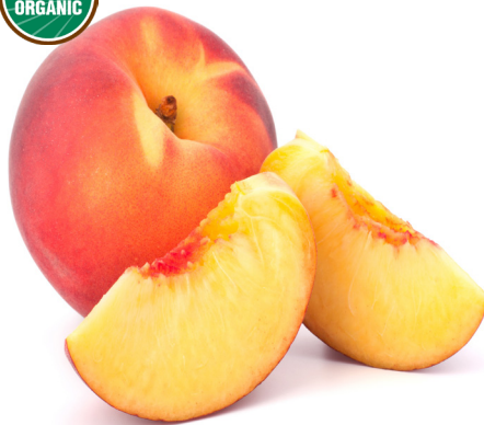
Organic Colorado Peaches