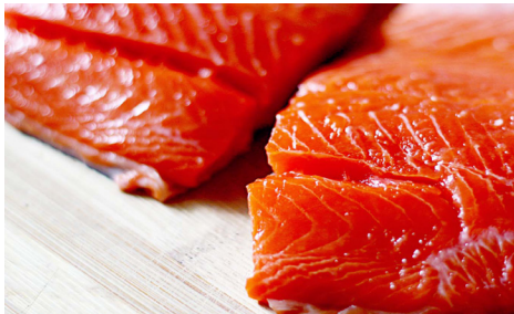
North Atlantic Farm Raised Salmon Steaks