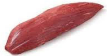
Pasture Fed Petite Beef Tenderloins