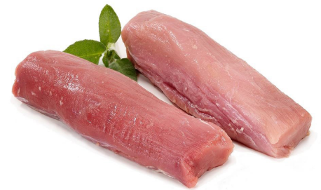
All Natural Pork Tenderloin