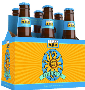
Bells Oberon Beer 4-6-12 packs