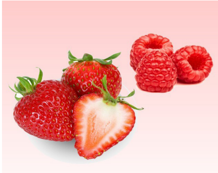
Organic 16 oz Strawberries & 6 oz Raspberries