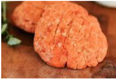
Fresh housemade Salmon Burgers