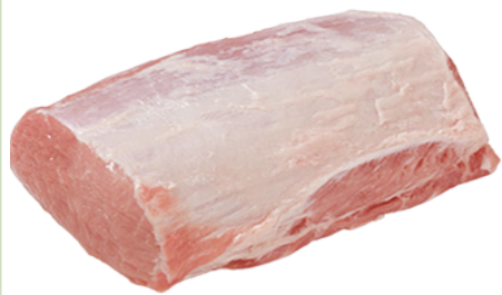
All Natural Boneless Pork Roast or Chops