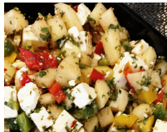
Apple Pepper Feta Salad