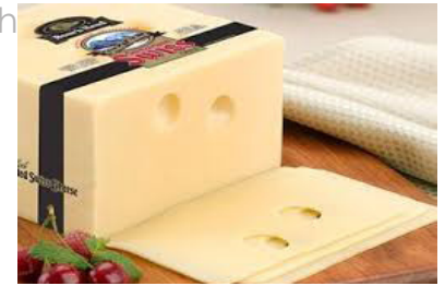
Boar's Head Imported Swiss - deli