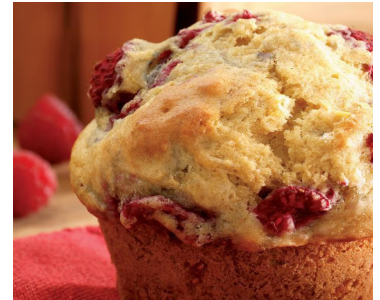
Organic Raspberry Lemon Muffin