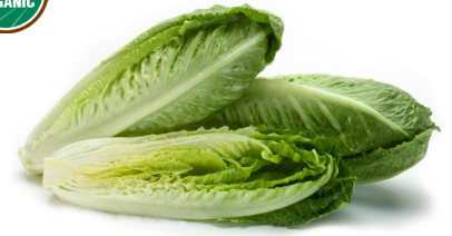
Organic Romaine Hearts - 3 ct