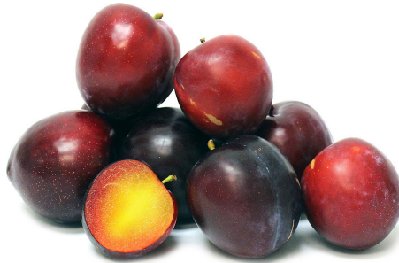
Organic Black Plums & Red Plums