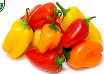
Organic Sweet Mini Pepper - 1 lb pkg