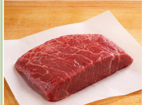
Ney's Pasture Raised Flat Iron Steaks