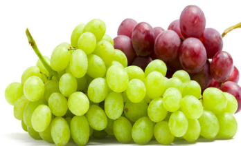
Organic Red & Green Grapes