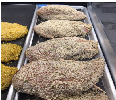
House Made Chicken Cordon Bleu & Broccoli Cheddar Stuffed Chicken Breast