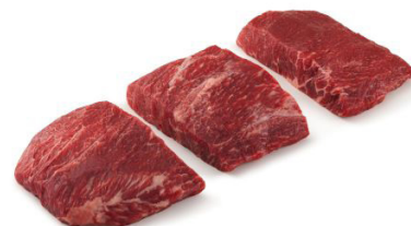
Pasture Fed Flat Iron Steaks