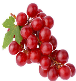
Organic Red Grapes