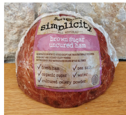
Boar's Head® Simplicity® All Natural* Brown Sugar Uncured Ham - deli