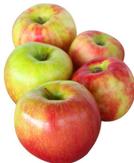
Organic Honeycrisp Apples